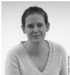
Architect Studio Sauerbruch Hutton