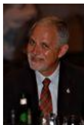
Chairman of Italian Ceramic Society