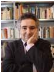
Editor of ARCH'IT

Teaches at the California State University in Florence and the Kent State University in Florence. Interested in issues regarding architectural history and criticism and in the relationship between technological innovation and project design, paying particular attention to new communication technologies. Since 1995 he has been editor of the magazine ARCH'IT ( www.architettura.it ), the first digital information platform to deal with contemporary architecture, and is actively involved in a series of projects aimed at promoting contemporary architecture and developing digital technologies. Since 1997 he has been in charge of the BEYOND MEDIA festival ( www.beyondmedia.it ), one of the leading international events that provide an overview of the very latest outlooks in contemporary architecture. With Image ( www.image-web.org ), he works to promote the adoption of project communication systems.