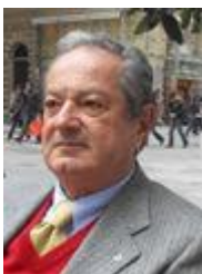
Chairman for Training, Schools and Universities, Confindustria Ceramica