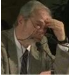
Professor of History of Philosophy, University of Modena and Reggio Emilia