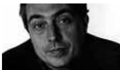
architect and urban planner