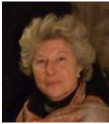
Professor Turin Polytechnic