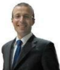
President and director of WinMedical

WINMedical (certified ISO13485 and ISO9001) is a leading manufacturer of electro-medical devices for departments with low to medium intensity of medical care. It designs, develops and markets wireless medical systems using state-of-the-art technology, for the well-being of men and women in the third millennium.