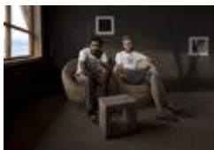
TYIN Tegnestue Architects