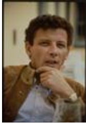
Architect and Professor of history of architecture, IUAV Venice