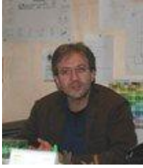
Lecturer at Cesena Architecture Faculty

Lecturer at faculty of Architecture of Cesena, Chairman of the Order of Architects of Bologna and owner of the firm Arkit & Partners. He has won numerous awards and recognitions in national and international competitions and was invited to the exhibition "Italian Architects under 50" at the Triennale in Milan.