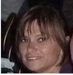
UNI (Secretary of CEN TC 67 "Ceramic Tiles")

Technical Officer within the Department "Building, civil engineering works, installations and energy" of UNI - Italian Organization for Standardization.