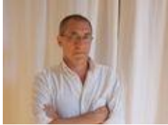
Architect Fare studio