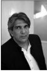
Mumbai studio (India)