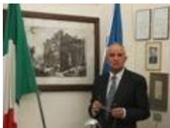
Professor Accademia di Belle Arti di Ravenna