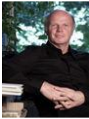
Architect, Peterlorenzateliers (AT)