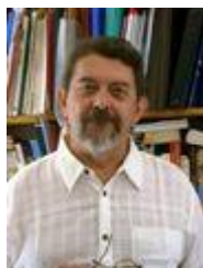
Centro Ceramico Bologna