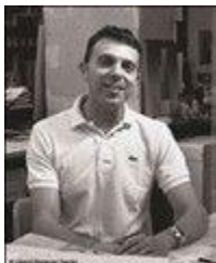
Senior Partner RPBW