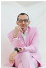
Architect and Designer

Karim Rashid is one of the most prolific designers of his generation. Over 3000 designs in production, over 300 awards and working in over 35 countries attest to Karim's legend of design. Karim's diversity affords him the ability to cross-pollinate ideas, materials, behaviors, aesthetics from one typology to the next, crossing boundaries and broadening consumer horizons.