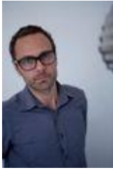
Architect and designer