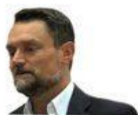
Scientific Director, Construction Platform Emilia Romagna advanced technology network