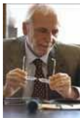
Director of Italian Human Sciences Institute