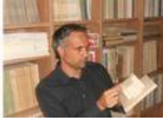
Architect and researcher Department of Architecture, University of Bologna