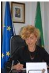
Director General of the Anti-counterfeiting Directorate - UIBM