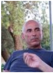
Professor Faculty of Architecture - University of Rome La Sapienza