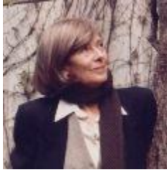
Architect and Designer