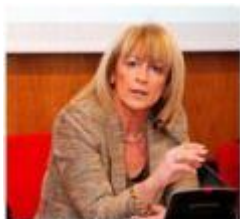
Chairman of the National Anti-counterfeiting Council