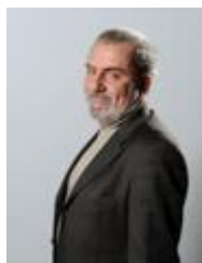
President of Nuvolaverde