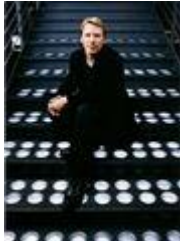
Architect and CEO of Architecture for humanity