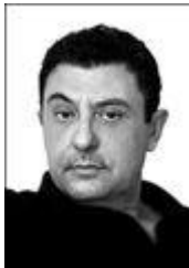
Architect and Professor of history of architecture, Milan Polytechnic