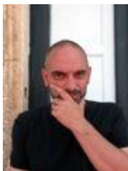
Coordinator of the Id-Lab projects in Turin and professor of design at the Bocconi University of Milan