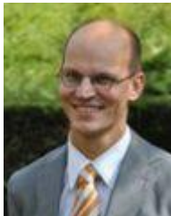
Director of Cerame-Unie