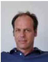
RPBW associate architect and project manager

Born in Zeist, Netherlands, in 1960, studied at the Delft Technical University in the Netherlands. He joined the Paris Building Workshop in 1994, and he is an associate since 2000. He worked on the Berlin Potsdamerplatz Project until 1997. From 1997 until 2002 he worked as project architect on the 3rd phase of the Lingotto factory conversion in Turin, including the Politecnical School, and the Meridien hotel extension. From 2000 until 2002 he worked as lead architect on the Pinacoteca Agnelli, at Lingotto. From 2003 until 2010 he was associate in charge of the Saint Giles project in London.