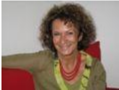
Superintendent for artistic heritage Emilia Romagna