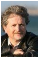
Anthropologist and Architect