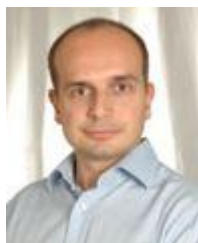
Researcher at CNR Bologna