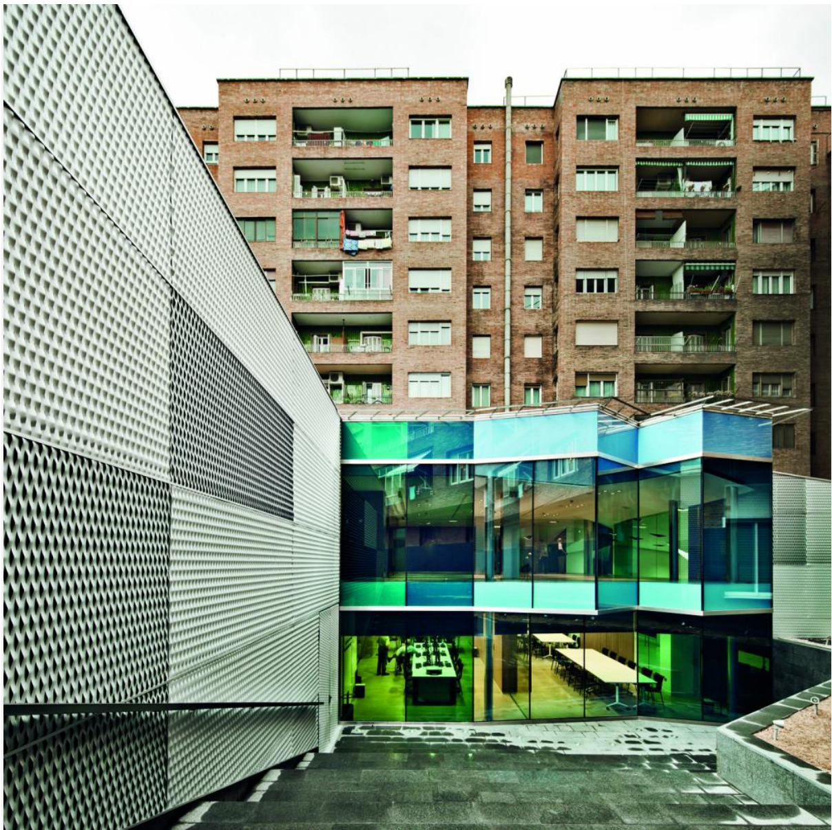
Main facade of the building. EspaiCaixa is located in the interior of the block building, Image Courtesy © Jordi Surroca

The aim of this project was the conversion of the existing building into a cultural and social centre, which would provide it with institutional representation. The outset was a dark, half-buried building that lacked quality spaces, placed at the interior of a block in Girona. The vast remodelling program included a 180-seat auditorium, an exhibition room, a computer room and an administrative area, among other spaces.