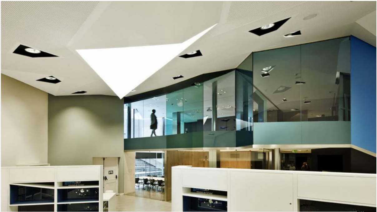
Computer area