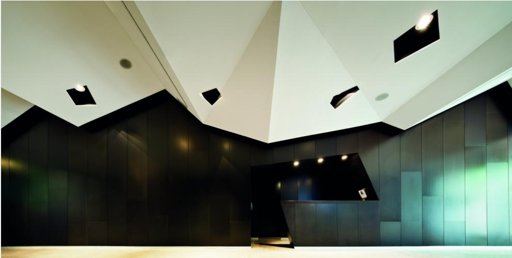
Hall of EspaiCaixa, Image Courtesy © Jordi Surroca

The vibrant design in the interior reveals its distinctive features to the façade, which is partially painted with the same colours as the interior. Despite the contrast between EspaiCaixa and the surrounding blocks, the overall integration with the urban fabric is improved with respect to the previous building. Moreover, it becomes an inner block used and frequented by the neighbours.