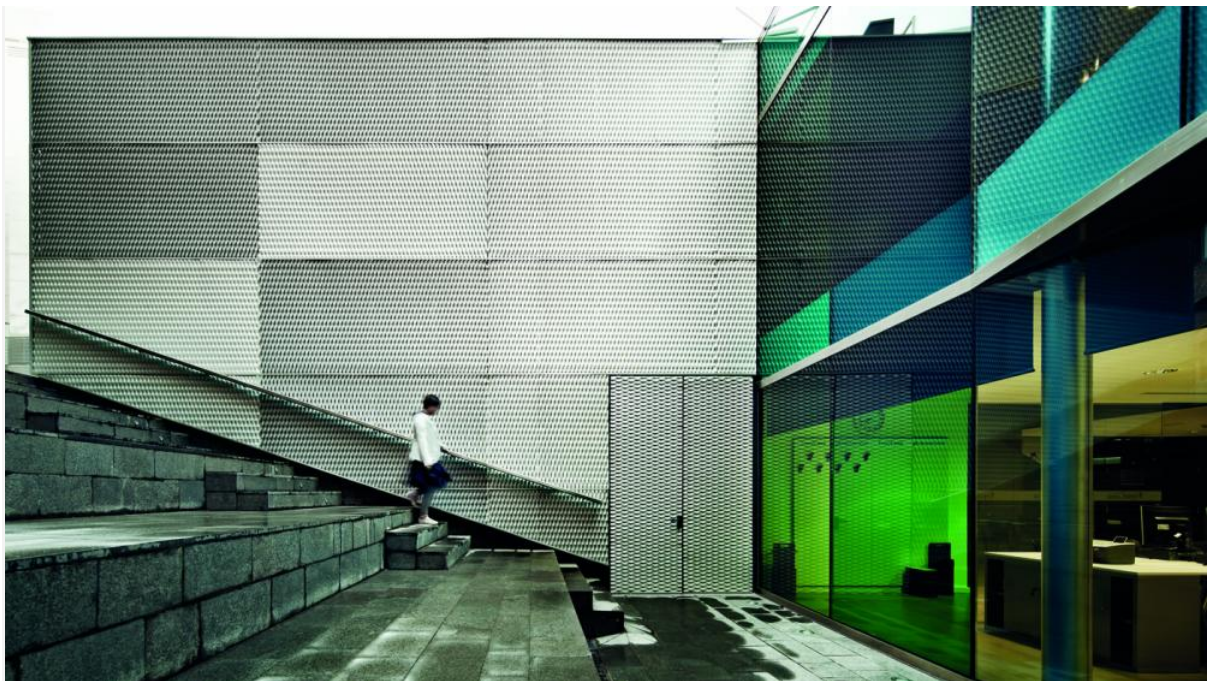
Entrance facade, Image Courtesy © Jordi Surroca

We decided to work on the existing building in order to take full advantage of a very expressive interior space, whilst proposing a powerful image both to interior and exterior spaces.