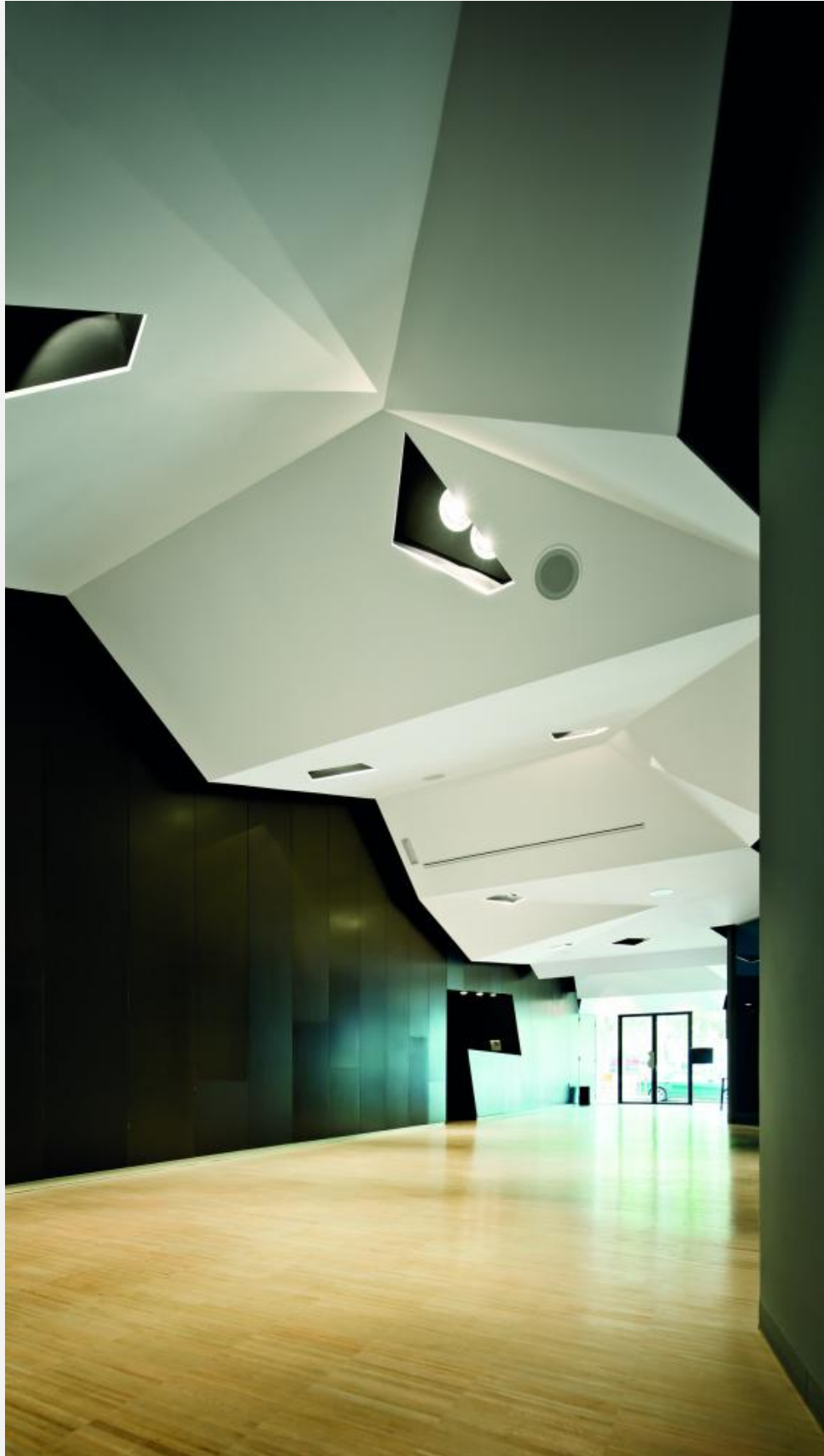
Hall of EspaiCaixa