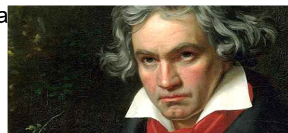
Ludwig van Beethoven

La Nona Sinfonia di Beethoven: Concerto all'Auditori di Barcellona mar, 28. gen 2014, 20:30 Auditori de Barcelona, Barcellona Sala Pau Casals