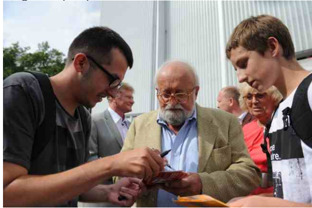
Krzysztof Penderecki (C).

Spread over 13,000 square metres, the edifice takes in five floors (two of which are underground), with two concert halls, the larger seating an audience of 953, the smaller accommodating 192 people.