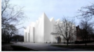
Szczecin Philharmonic Hall

The new Philharmonic Hall in Szczecin (North West Poland) will be inaugurated on 28 February 2014. Work on the new building, which was designed by Barcelona-based architectural firm 'Estudio Barozzi Veiga', began in April 2011. There will be two concert halls, the larger seating an audience of 953, the smaller accommodating 192 people. The top floor will serve as a space for exhibitions. The new venue has its own car parking in the underground.