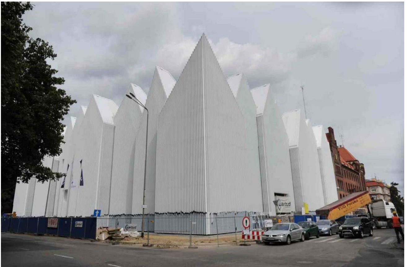
Facade of the new Philharmonic Hall, Szczecin.

Acclaimed composer Krzysztof Penderecki was given a sneak preview on Monday of the forthcoming Philharmonic Hall in Szczecin, north west Poland.