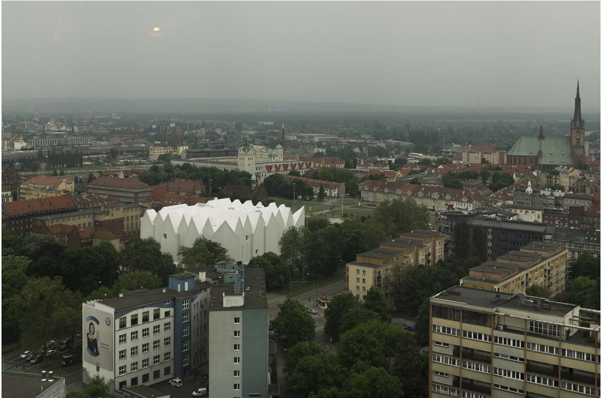
Barozzi/Veiga, Mieczysław Karłowicz Philharmonic Hall, Szczecin, Poland

The building is configured by a synthetic, but at the same time complex volume, which is resolved through a continuous promenade, which connects all these functions along a single public path through all the levels of the building. Externally, as in the adjacent preexistence, the verticality and geometry of the roof prevail. These characteristics identify the Philharmonic Hall with its surrounding context.