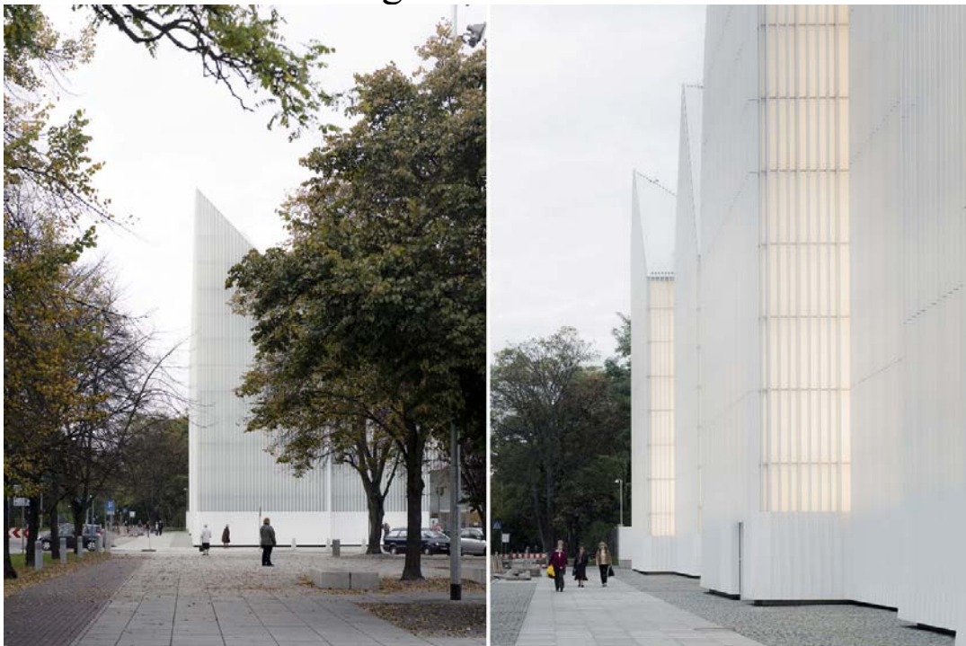
Barozzi/Veiga, Mieczysław Karłowicz Philharmonic Hall, Szczecin, Poland

In accordance with the central European tradition of the classical concert halls, decoration becomes ornament and function. The hall is composed following a Fibonacci sequence whose fragmentation increases with the distance from the scene, and gives shape to an ornamental space which reminds of the classical tradition through its gold-leaf covering.